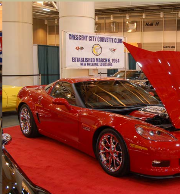
International Auto Show March 20, 2011