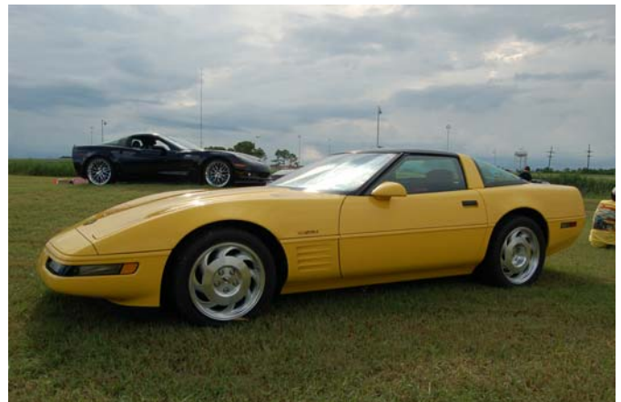
Respect Your Elders