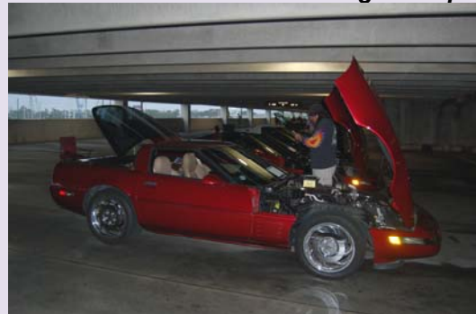
San Jacinto CC had a nice turnout of C4s