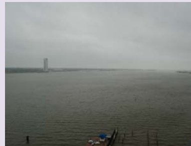
Not your favorite looking day for a Corvette show, but it turned out to be a good trip