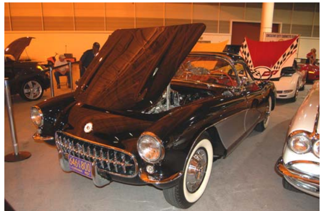
Vintage Corvettes Were Crowd Pleasers