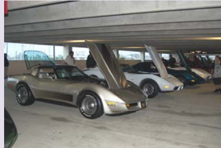
These guys were prepared for the bad weather. The turnout was great and their hospitality rewarded us for our efforts with the challenging rain event

Some of our La. Chapter members traveled to Kemah Texas to participate in the San Jacinto Corvette Club annual car show