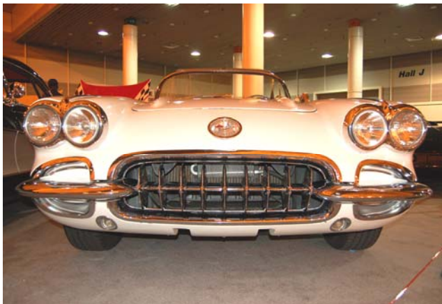
Vintage on Display at International Auto Show