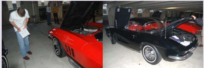
These guys were not going to let a little rain spoil their event. Even the vintage Corvettes turned out!