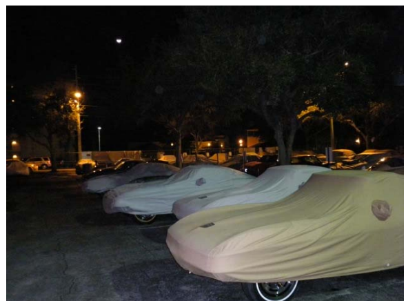
Time to go for a ride