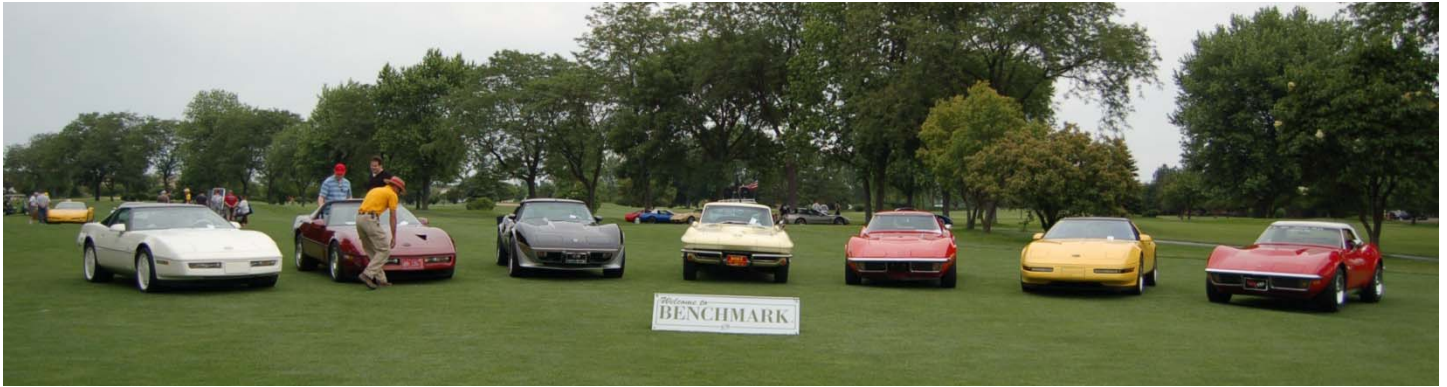
2011 Bloomington Gold Benchmark Show Field