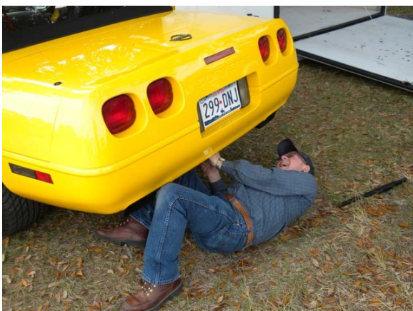
How'd you get your finger in there ?