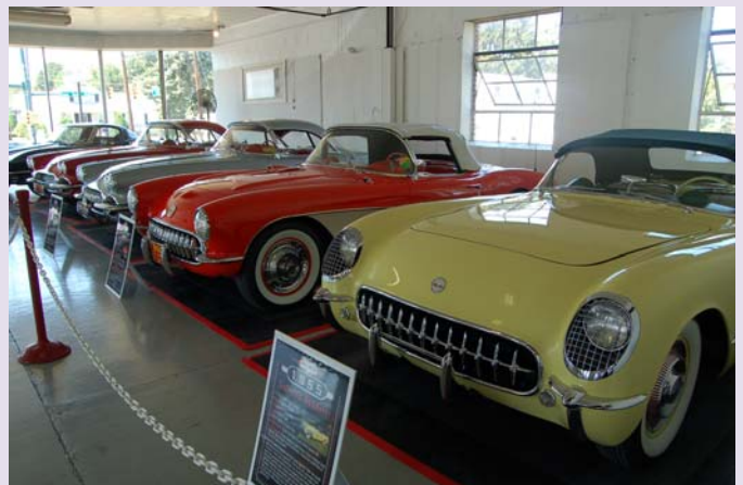
Look But Don't Touch!