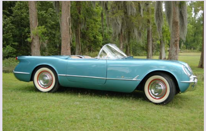
Beauty on the Bayou