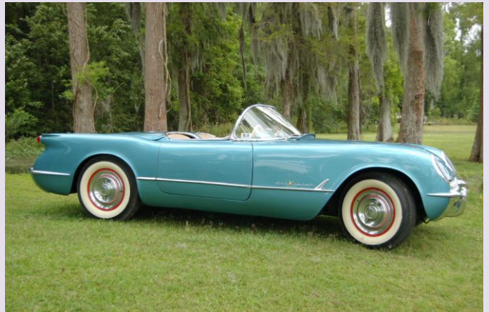
Beauty on the Bayou