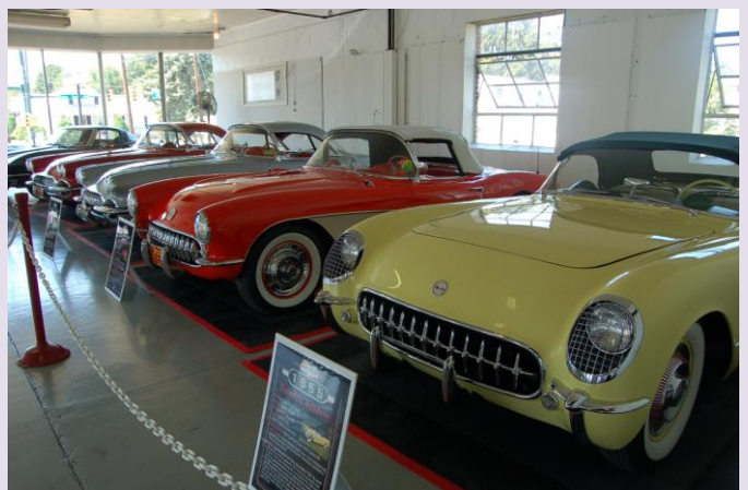
Look But Don't Touch!