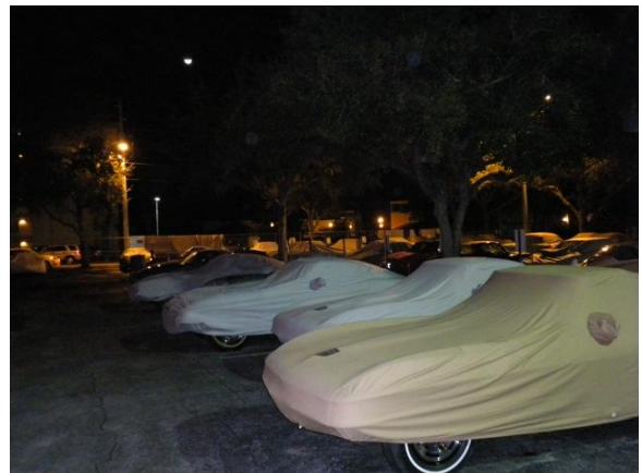
Time to go for a ride