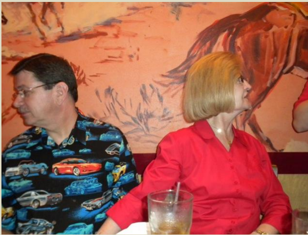
Who Dat Said Dat??