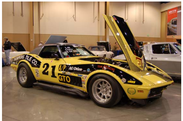
About a year ago we were checking these beauties out at the Mecum Auction in Orlando. Don't forget about the Winter Regional!