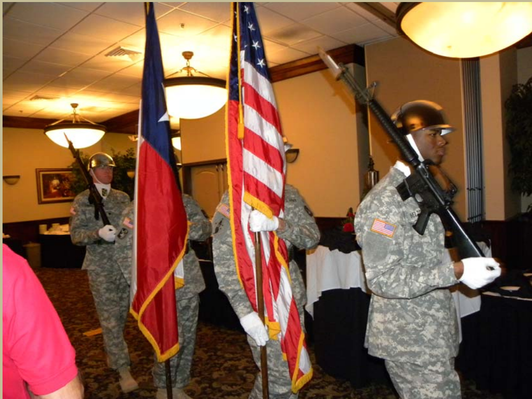
Event attendees were given an opportunity to show respect the way it should be done!

(Pretty handsome bunch...from a distance)