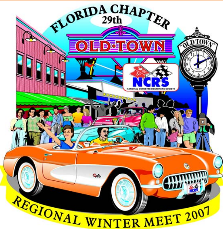
(from our image archives)