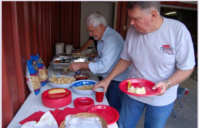
YO! GOTTA EAT!

On another related note, I am happy to report that we are up to date with inputting our judging points in the NCRS Database. Remember, I am also tracking member activities in our database, so let me know if you participate in a qualifying event.