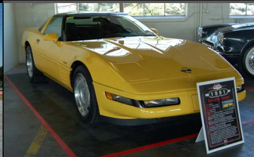
Psycho gets a big smile!!