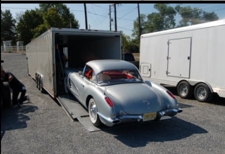
Bring the babies out!