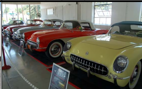
Straight Axle showcase!