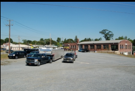
Babysitters stand by with precious cargo