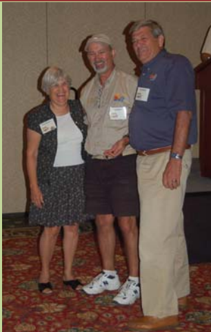
NCRS President's Award!

805 East F Street Rayne, Louisiana 70578 http://www.ncrs-louisiana.com