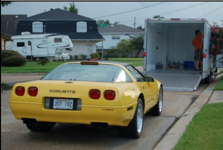
We dodged the rain as we loaded up