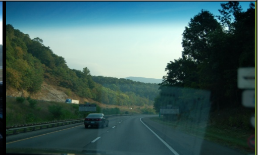
3 dimensional landscape is different!